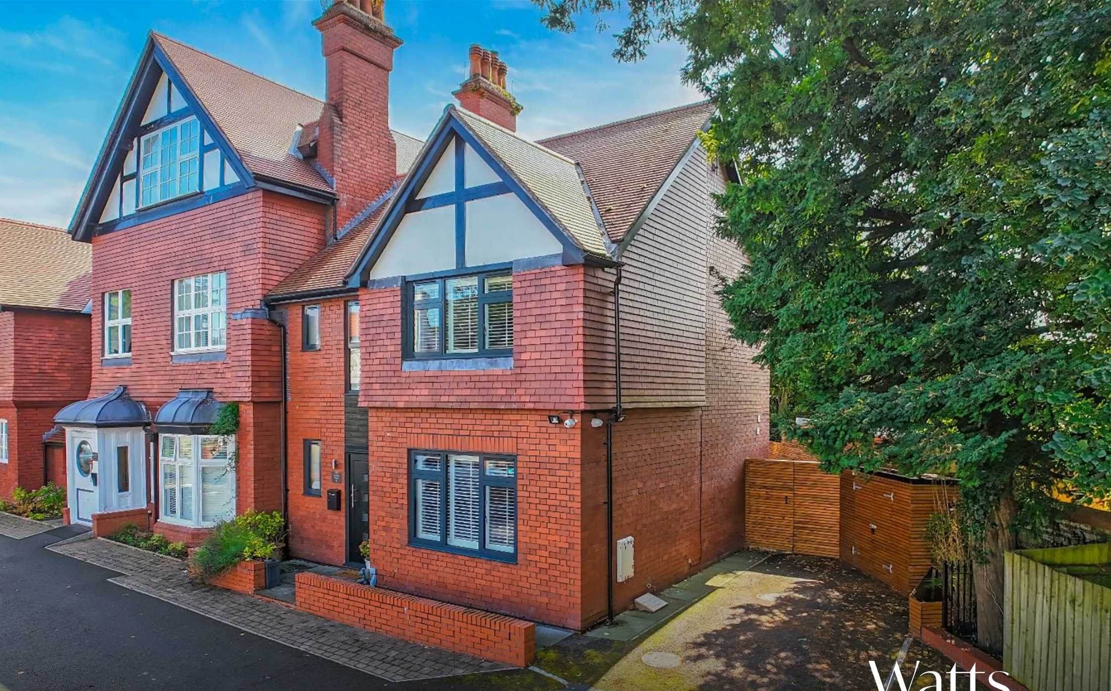
The Townhouse, 8 Pen Y Garth Mansions, 2 Stanwell Road Penarth, Vale Of Glamorgan, CF64 3EA